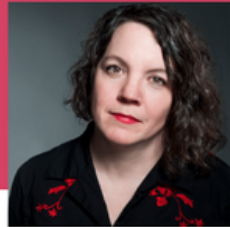
SONJA LARSEN MEMOIR: FROM MEMORY TO MEANING