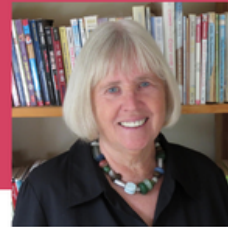
MARGRIET RUURS CHILDREN'S WRITING AND PUBLISHING